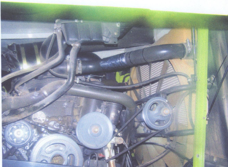
Modified charge air tube in the engine compartment

The measurement had been realized on an acreage of 15 ha (37 acres) with regular crop. Furthermore, the complete chaff had been scaled on a vehicle scale of a biogas plant.